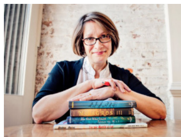
Author Meg Medina to visit Seneca Ridge MS and Sterling MS

Seneca Ridge MS and Sterling MS received support for a project focused on the bicultural experience that features a lesson from Cuban American author Meg Medina, whose work for children and young adults focuses on how cultures intersect. Potowmack ES will use grant funds to purchase biographies of multicultural figures for a "Browsing Biographies" reading program. Sully ES's "Power of Everyone" program will band together the ELL community to build a garden. We wish these schools success in implementing these impactful programs.